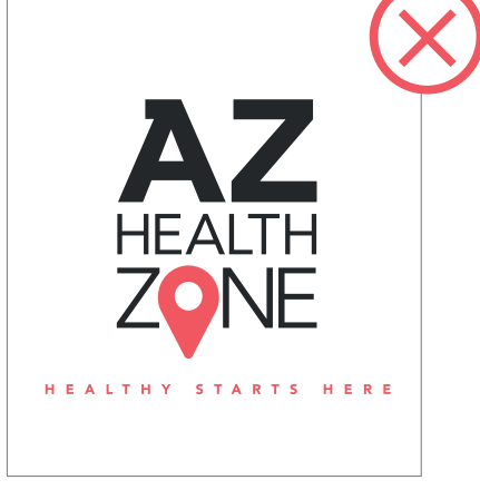
DON'T ALTER ICON COLORS