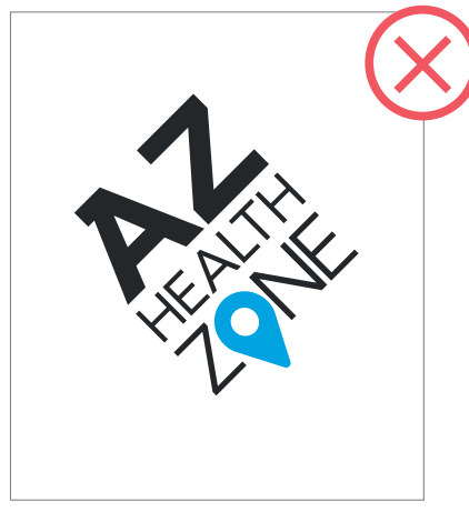
DON'T ANGLE LOGO