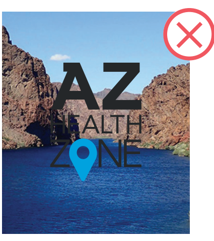
DON'T PLACE LOGO ON PHOTOS WITHOUT SUFFICIENT CONTRAST