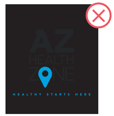
DON'T PLACE COLOR LOGO ON DARK BACKGROUNDS